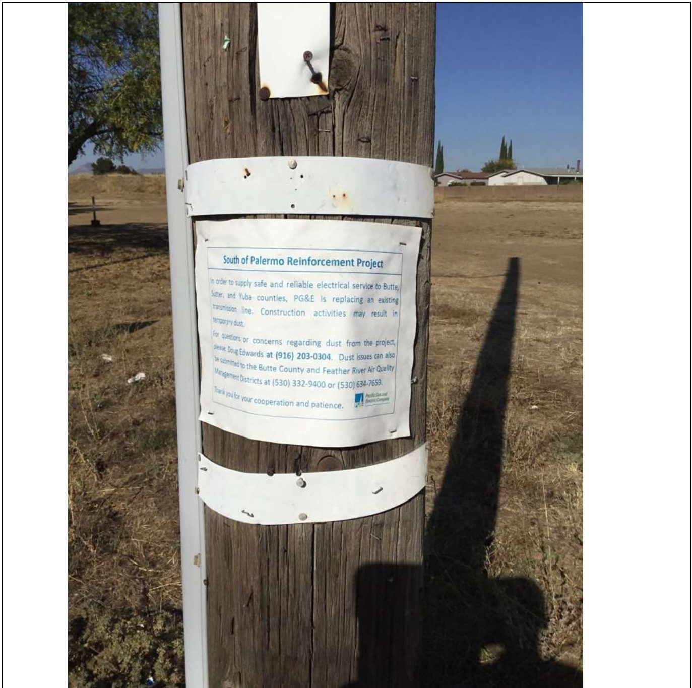
Photo 4: Air quality signs posted with the telephone numbers of the contractor and Air District for any questions or concerns about dust from the project in accordance with APM-AQ-2.