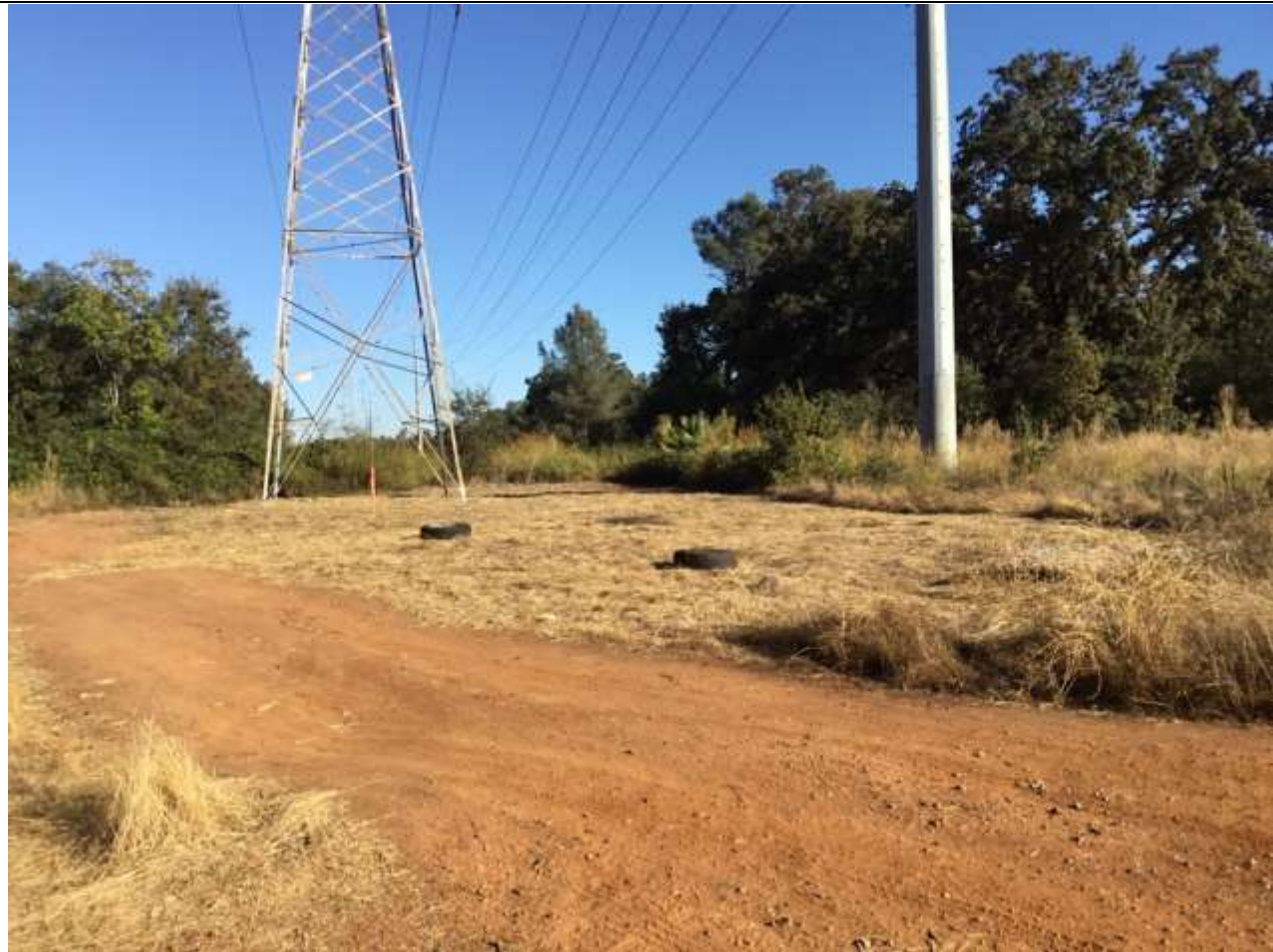
Photo 2: Completed site preparation work at structure 3/25. The area was staked to define the work boundaries prior to ground disturbance.