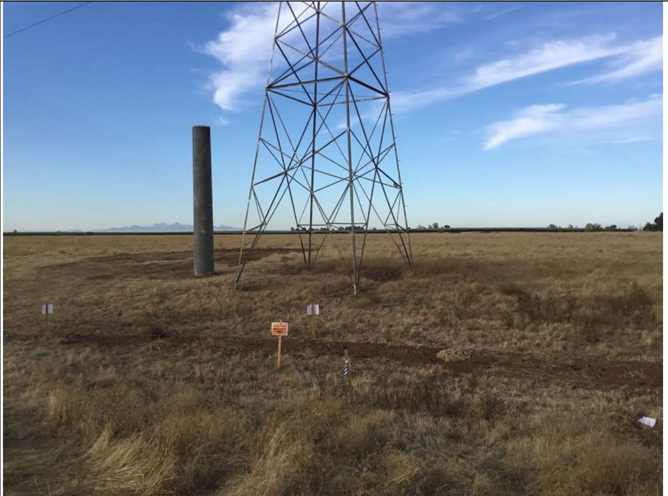
Photo 3: Sensitive environmental resources were clearly marked with signs at Segment 7/56 in accordance with the project requirements.