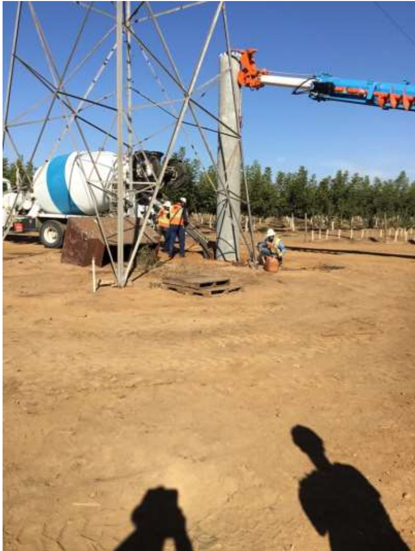
Photo 1: The CPUC EM observed crews pouring the new foundation at structure 3/98.